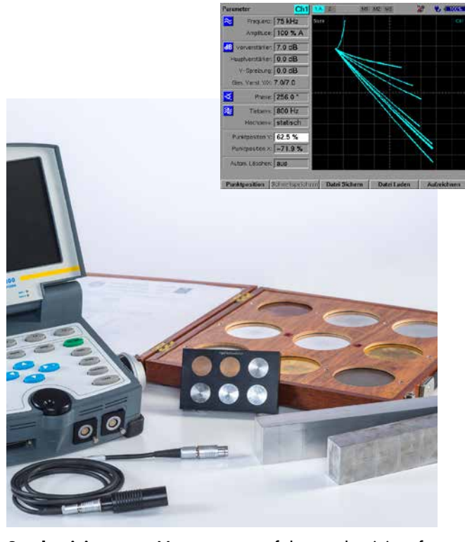
Conductivity test – Measurement of the conductivity of non-ferromagnetic metals and coating thickness measurement