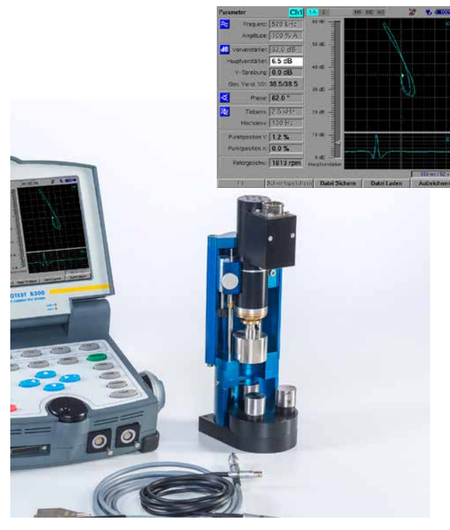
ELOTEST B300 and HDR-18 Rotor – dynamic testing with rotating sensors

The ELOTEST B300 universal eddy-current test instrument offers numerous application possibilities.