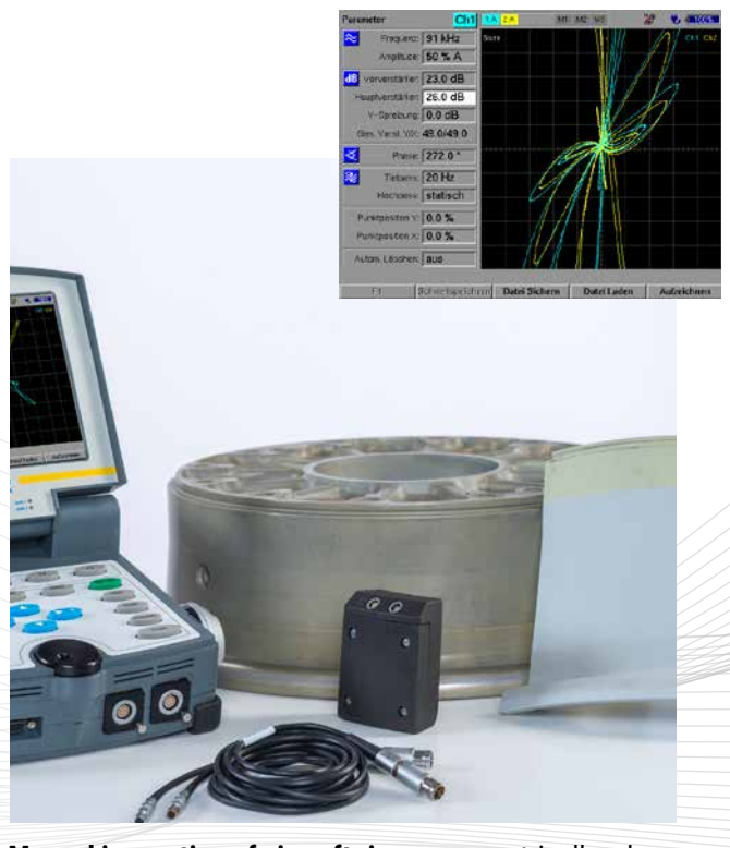
Manual inspection of aircraft rims – geometrically adapted sensors with 25 - 100 mm track width possible